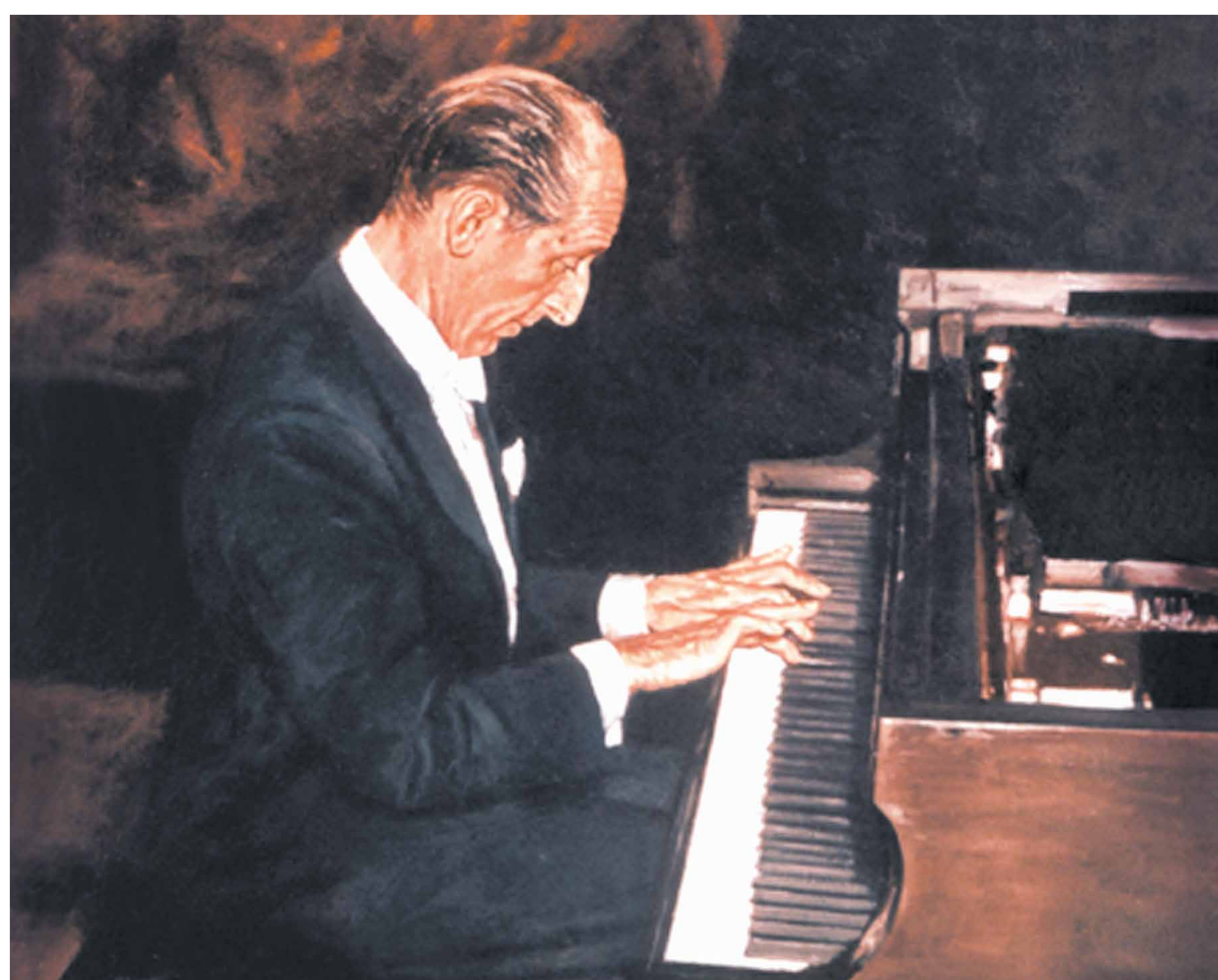
Vladimir Horowitz and his beloved CD 503 depicted in oil painting.

This is the piano Horowitz kept in his New York townhouse and used in many recitals and recordings in the 1970’s and 80’s.