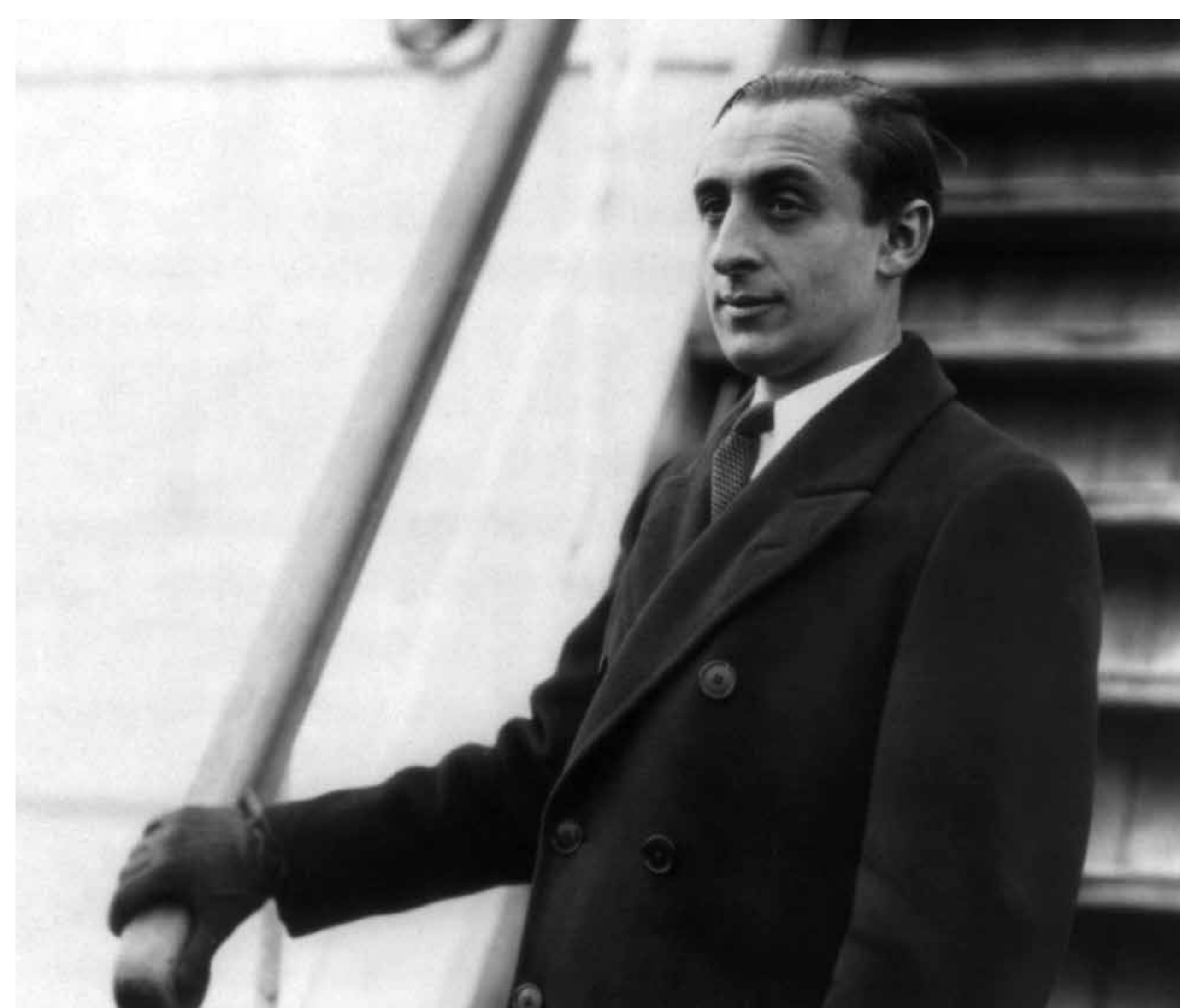
Vladimir Horowitz in 1931, two years before he married Wanda Toscanini.

Widely recognized as one of the greatest pianists of all time, Vladimir Horowitz was born in Russia in 1903 and rose to international acclaim. “Held in awe by aficionados of the instrument, Mr. Horowitz virtually cornered the market on celebrity among 20th-century pianists,” wrote the New York Times upon the pianist’s death in 1989.