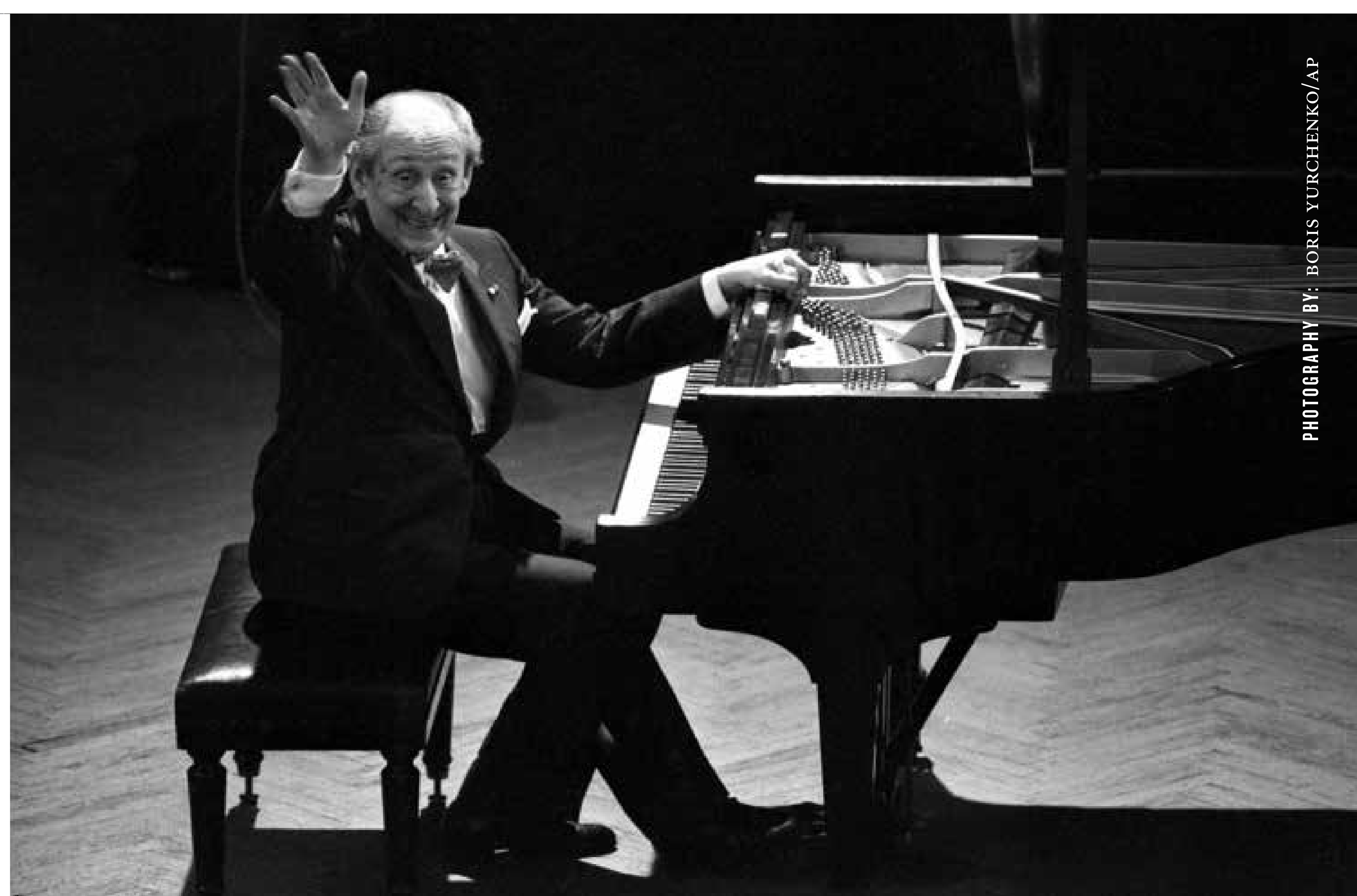
Horowitz performs in Moscow in 1986 with CD 503.

After serving Horowitz for decades in his home, because he loved the sound and touch of this piano so much, it became his exclusive tour piano for the last four years of his life, including his triumphant 1986 return to Moscow. For the purposes of the STEINWAY Concert & Artist Department, two or three digit numbers have always been used to identify the C&A pianos. This Horowitz STEINWAY, #314,503, was known on tour as CD 503.